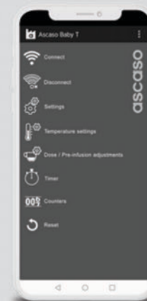
AscasoApp. Total control

Energy efficiency . We deliver a 50% average saving compared with a traditional machine and 25% compared with other multi-boiler machines.