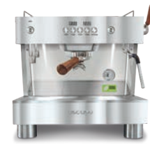
1GR Full Stainless Steel