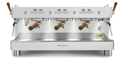
3GR Full Inox