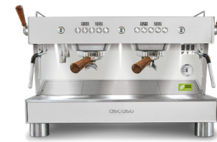
2GR Full Inox