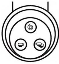
Auto Volumetric (AV)